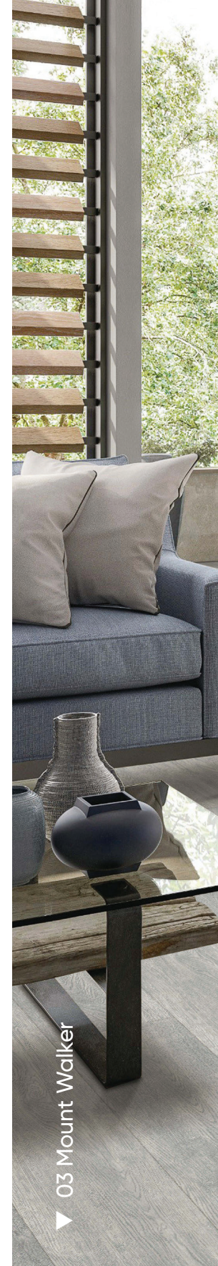
▶ 03 Mount Walker

The product is treated with a pearl touch aluminum oxide finish suitable for high traffic areas. It is easy to maintain and guaranteed to last. This finish provides exceptional durability that eliminates premature wear, repels stains, stands up to everyday use and provides long life.