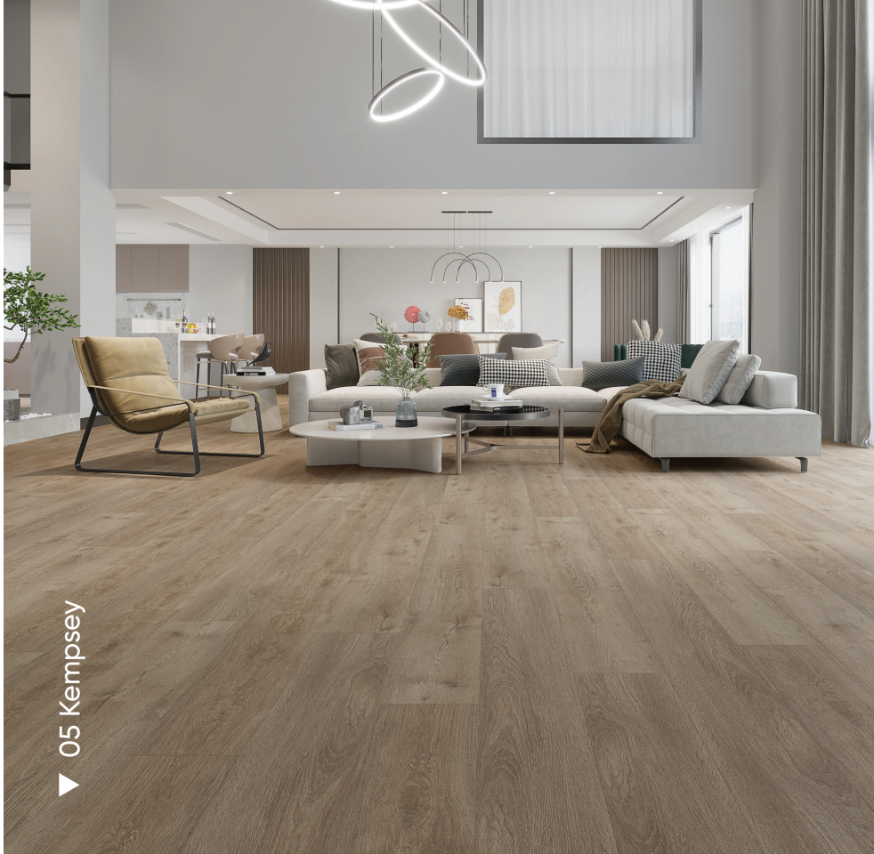
▶ 05 Kempsey