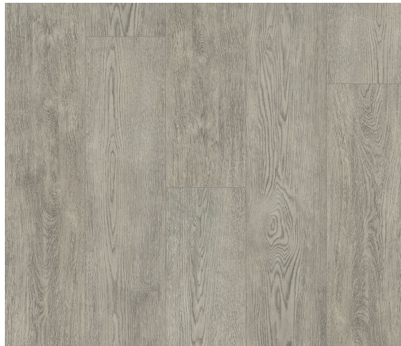
03 Mount Walker