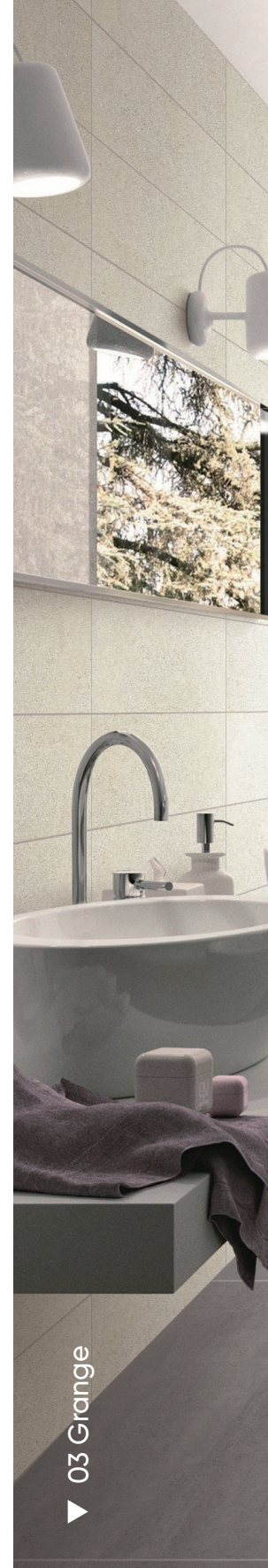
► 03 Grange

The product is treated with a pearl touch aluminum oxide finish suitable for high traffic areas. It is easy to maintain and guaranteed to last. This finish provides exceptional durability that eliminates premature wear, repels stains, stands up to everyday use and provides long life.