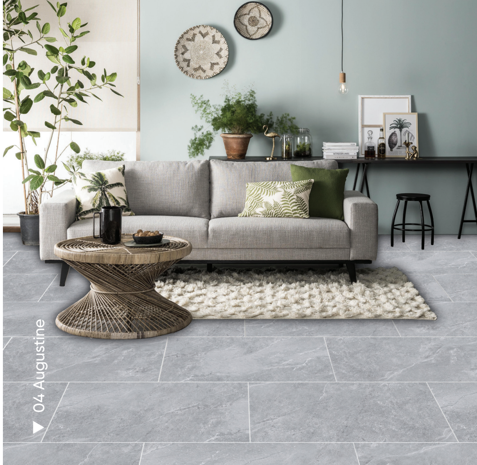
► 04 Augustine