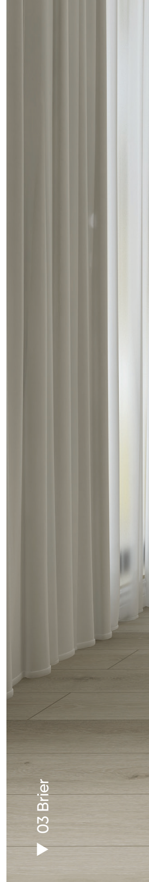
▼ 03 Brier

The product is treated with a pearl touch aluminum oxide finish suitable for high traffic areas. It is easy to maintain and guaranteed to last. This finish provides exceptional durability that eliminates premature wear, repels stains, stands up to everyday use and provides long life.