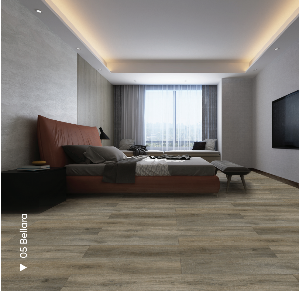
▼ 05 Bellara