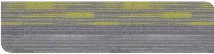
02 | Green Envy