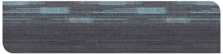
08 | Cobalt Teal