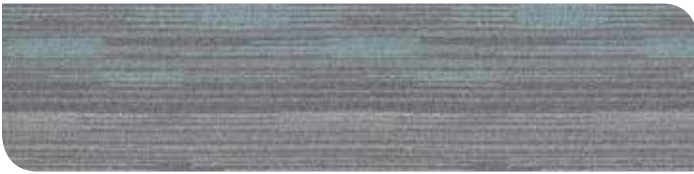
01 | Tidal