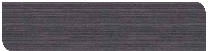
16 | Black Gesso