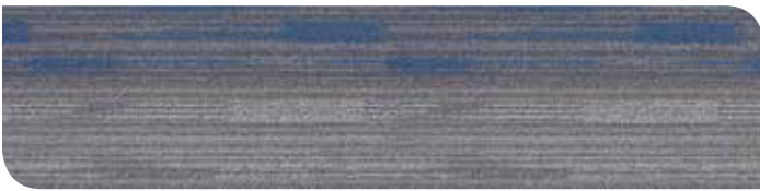
06 | Deco Blue