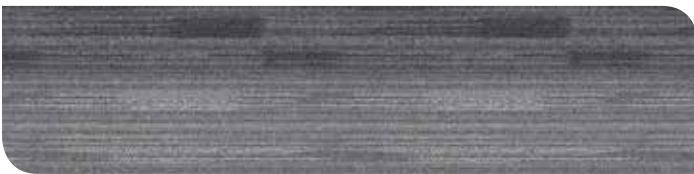
05 | Foreshadow