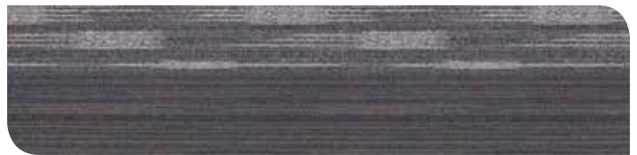
14 | Silver Screen