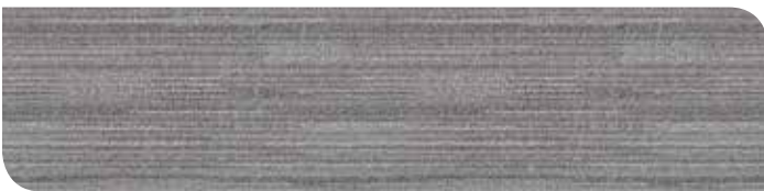
07 | Canvas Grey