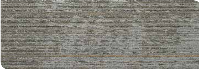
01 | Iced Marble