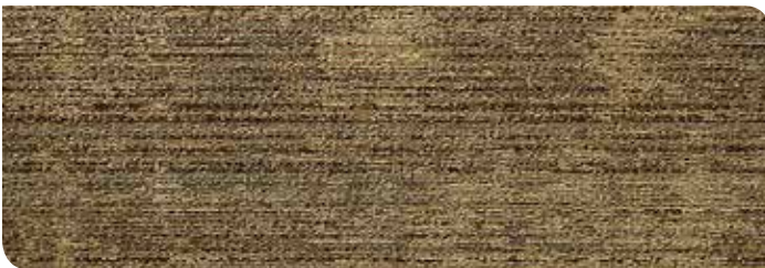
03 | Northwood Trail