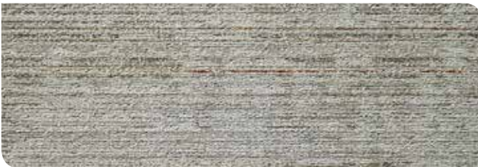
05 | Rain Dunes