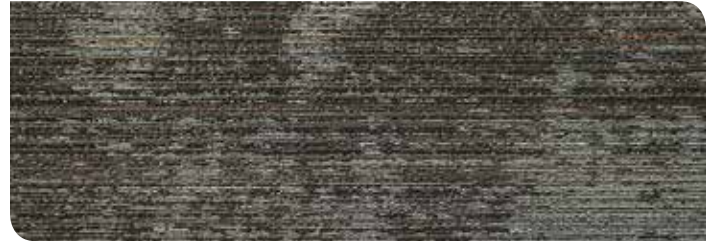
02 | Newburyport