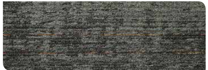
06 | Umber Rust