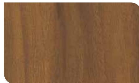
Cambridge Walnut KPLSN1784-7