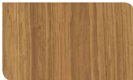
Westbank Oak APE615