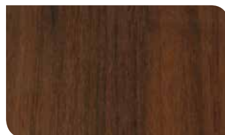
Creekview Mahogany APE808