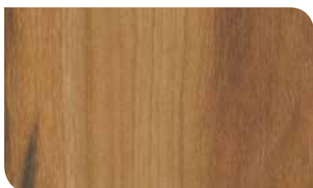
Coast Walnut APE027