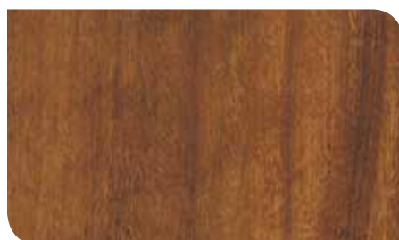
Penticton Rosewood APE028