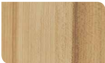
Poma Maple APE667