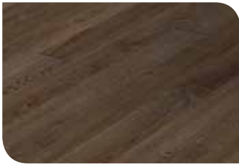
Martinez Oak KPLA10003LP