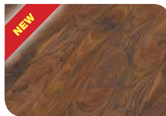
Westford Acacia KPLA10010LP