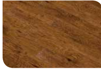
Brockton Hickory KPLA10002LP