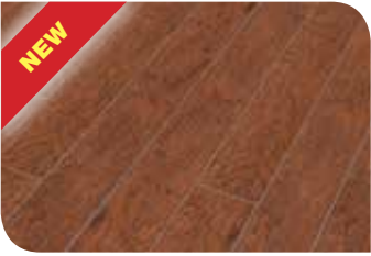
Cranston Hickory KPLA10008LP