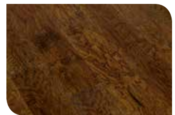
Charleston Hickory KPLA10001LP