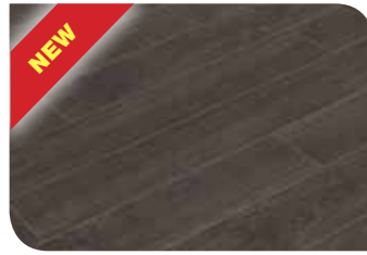
Cape Cod Oak KPLA10007LP