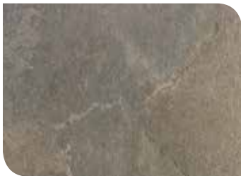
Rofrano Slate KLTGRP71120