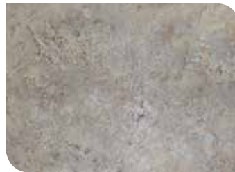
Talsano Travertine KLTGRP11120