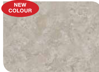
Kilkenny Stone KLTGRP31120