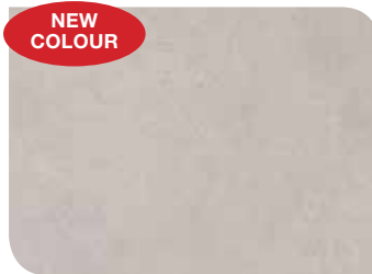
Santorini Limestone KLTGRP71320