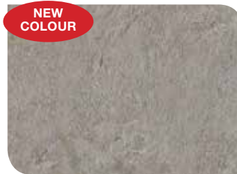
Burano Stone KLTGRP20620