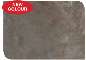
Visby Stone KLTGRP34620