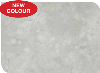
Reine Antique KLTGRP07120