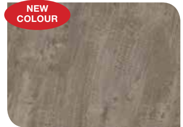
Ticino Slate KLTGRP21220