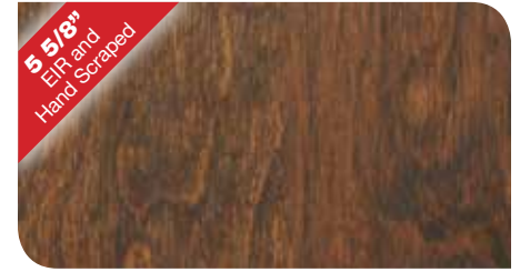
Cabana Hickory KPLHT8338L12