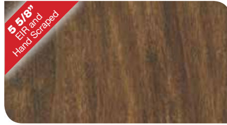
Haven Hickory KPLHT8336L12