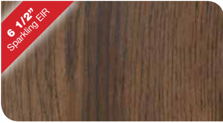
Inland Oak KPLHT9067L12