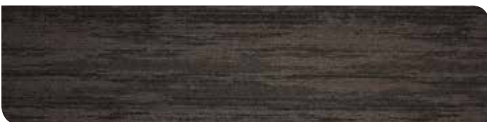
04 | Aztec Temple