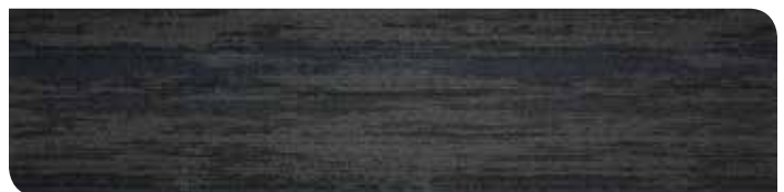
02 | Hudson Avenue