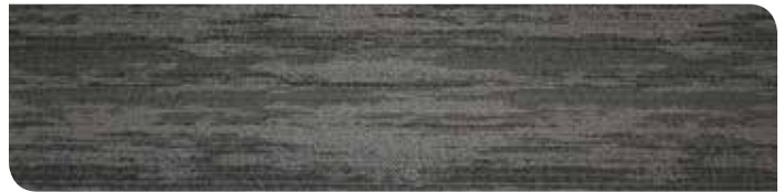
01 | Metro Stone