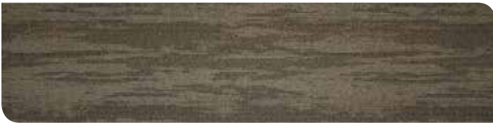
03 | Ironwood