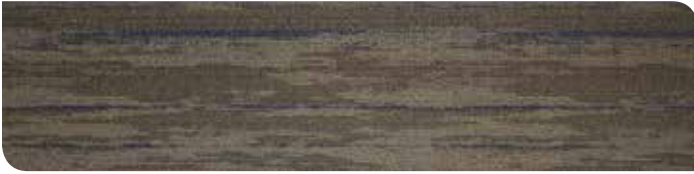
07 | Peppler