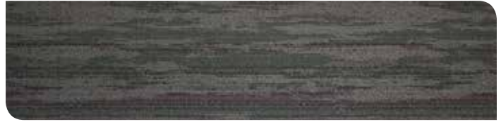
05 | Kaleidoscope